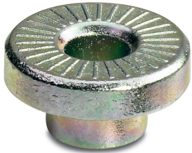
Special washer for floating mounting of docking frame

Please be informed that the data shown in this PDF Document is generated from our Online Catalog. Please find the complete data in the user's documentation. Our General Terms of Use for Downloads are valid ( http://phoenixcontact.com/download )